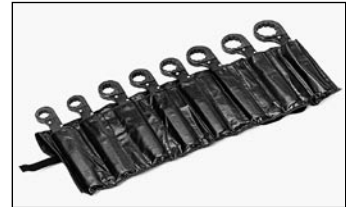
Fig. S149 — Par-Lok Wrench Kit