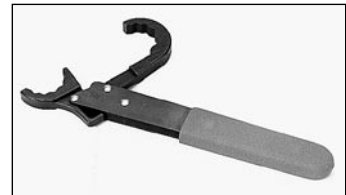
Fig. S150 — Par-Lok Wrench